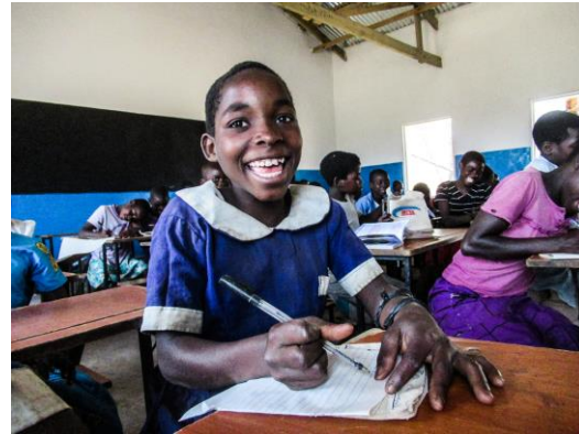
Students celebrate inside of their new school funded by GEMS Jumeirah Primary School