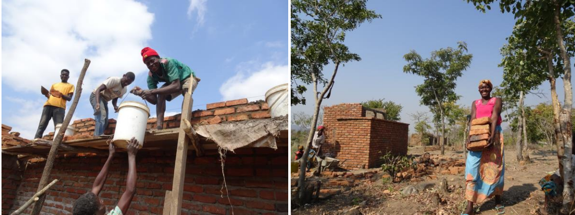
Sathamapira community members volunteer to help build a new school for their village.

Dubai Cares' implementing partner contributed the engineering materials, skilled labor, and project supervision for each project. Each village provided the land, local materials such as sand, and the unskilled labor to build the school. Additionally, every village promised to send girls and boys to school in equal numbers.