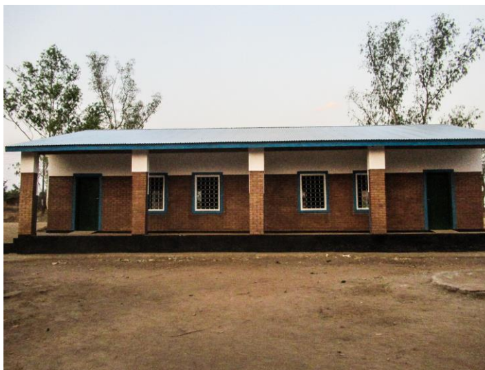
Completed Primary School in Sathamapira, Malawi